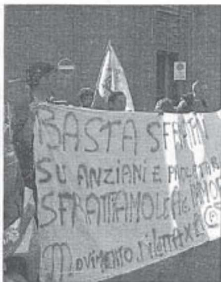
Sfratti sotto i riflettori. Sull'emergenza casa c'è un'iniziativa internazionale